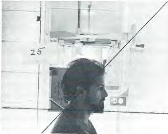
Fig. 2. Reference points and lines representing head posture on photographs.