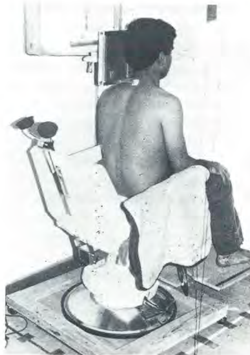
Fig. 3. Radiographic technique with ear rods out.

A 1-inch thick plywood board, measuring 12 × 16 inches, was constructed and attached with C clamps to the foot plate of the hydraulic chair. The plywood board provided a comfortable footrest for subjects to place their feet during postural recordings. Tape measures to